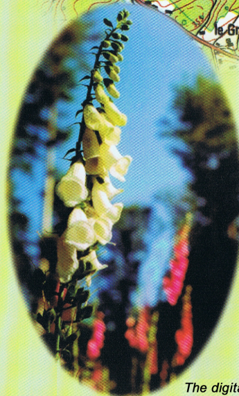
The digital white one